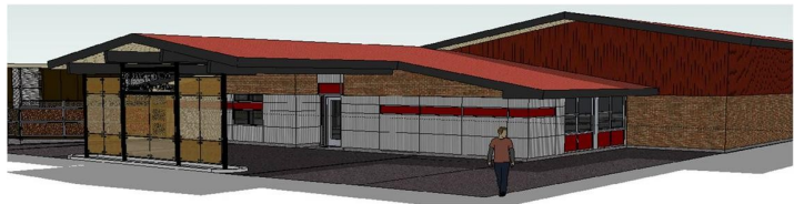
Artist's rendering of building exterior

The new centre includes a sensory room for quiet sensory stimulation and a motor and activity room for noisier, more physical, sensory activities, as well as a resource library and